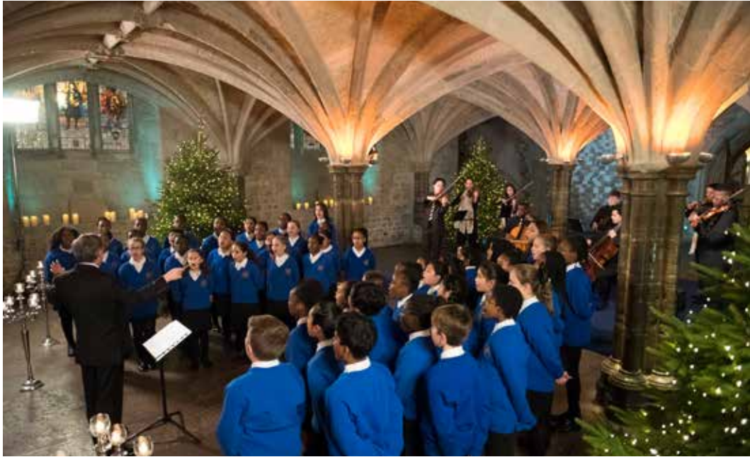
Members of the Commonwealth Youth Orchestra and Choir, conducted by CYO's Artistic Director and Emeritus Composer-in-Residence Maestro Paul Carroll, performing in the East Crypt, Guildhall, for the broadcast of The Queen's Christmas Message, 2017.

In 2011 the Commonwealth Heads of Government published their unanimous support of the Commonwealth Youth Orchestra and Choir with an unique international endorsement.