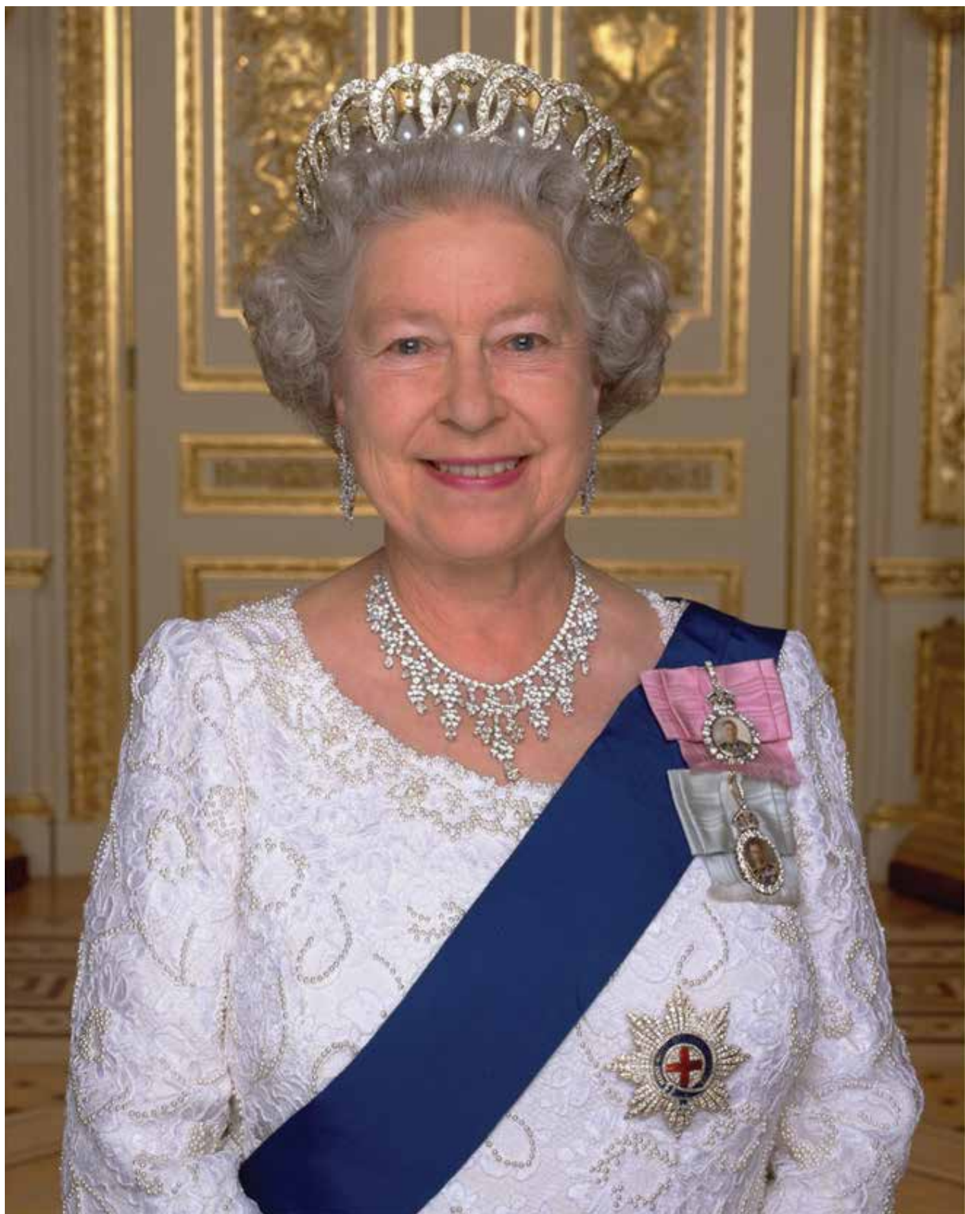
Her Majesty The Queen Head of The Commonwealth

Diamond Jubilee Patron 2012 Commonwealth Youth Orchestra and Choir